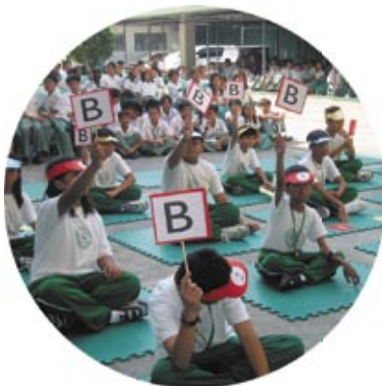
Students participate in an LG Quiz Bee format. Representatives vary from grades 4 to 6. These students were selected after a series of tests in their respective Science classes.