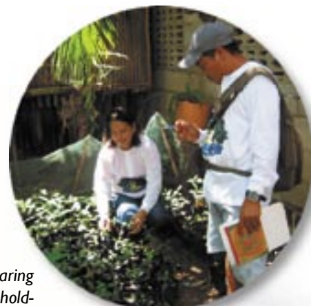
Volunteers preparing seedlings for household-based plotting.