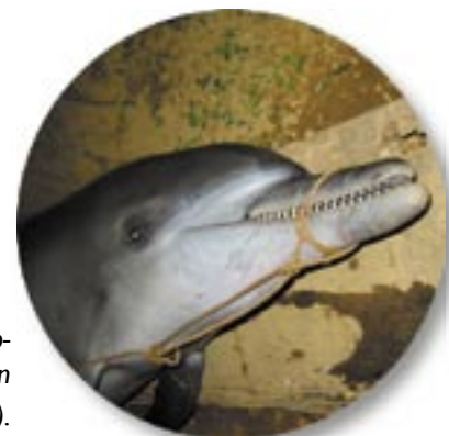
An accidentally caught Indo-Pacific bottlenose dolphin ( Tursiops aduncus ).

He added, “Hopefully, the confiscation serves as a precedent that will discourage locals from intentionally or unintentionally harming these ecologically important species. It is hoped that this experience will encourage the authorities to enforce rules in protecting our natural resources without fail nor falter.” •