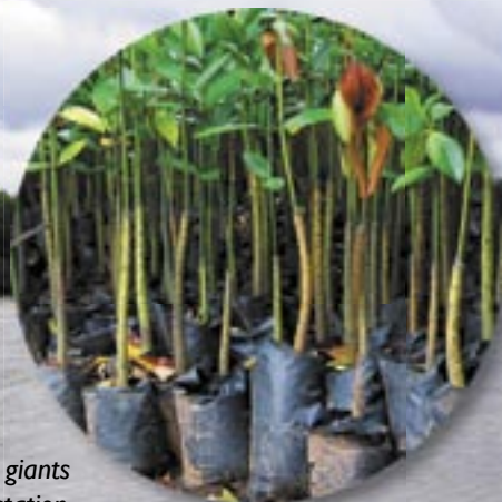
They might be giants – seedlings for reforestation.