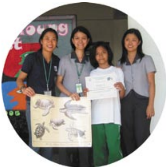
An awardee receives her certificate of participation to the Search for the Young Scientist Quiz Bee. From left: WWF's EE Officer with San Benildo Grade School Science Coordinators

"WWF left a valuable environmental message to our students and teachers as well. San Benildo will always be grateful to the organization." •