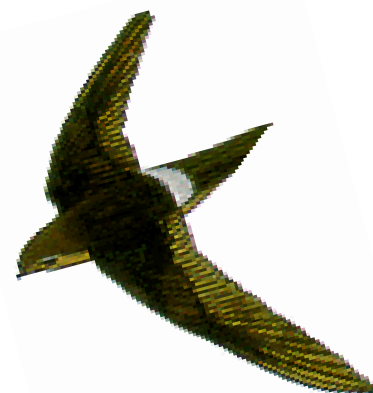
Edible-Nest Swiftlet ( Collocalia fuciphaga )